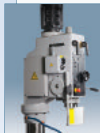
Built-in low voltage electrics and automatic tool ejection system lever