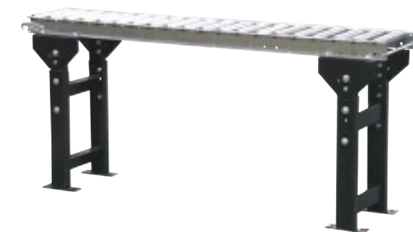
KSA64 5' x 12" wide roller stock table