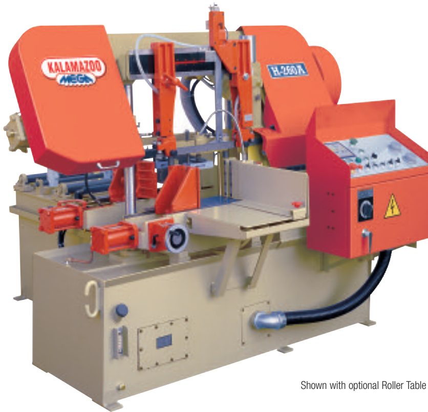
Shown with optional Roller Table