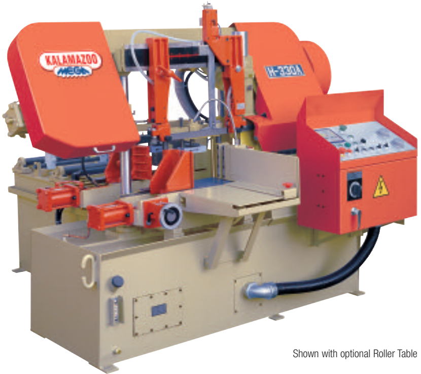
Shown with optional Roller Table