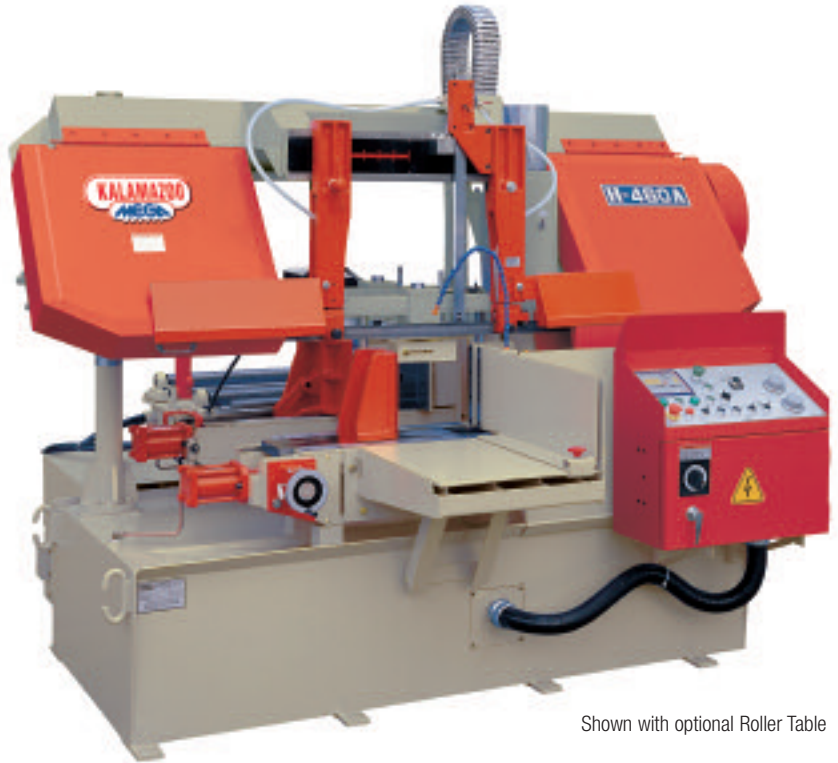
Shown with optional Roller Table