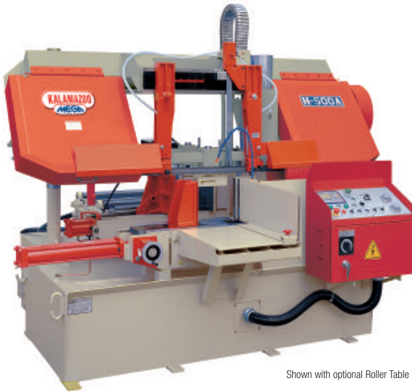
Shown with optional Roller Table