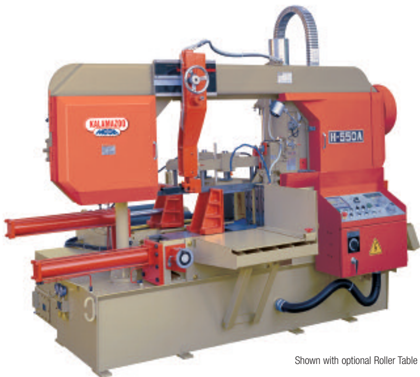
Shown with optional Roller Table